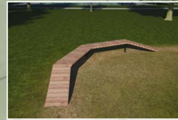
Zig Zag 90 Deg. Turn