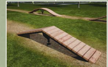
A Frame 30" width