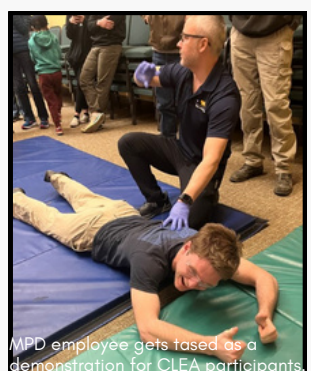
MPD employee gets tased as a demonstration for CLEA participants