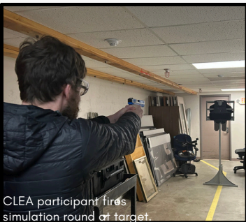
CLEA participant fires simulation round at target.

There are also hands-on activities, including a ride along with officers and a training simulator!