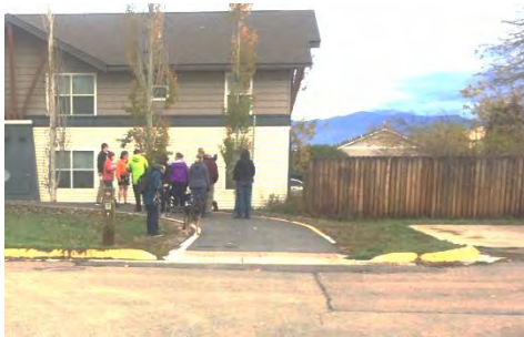
Justus Lane 3