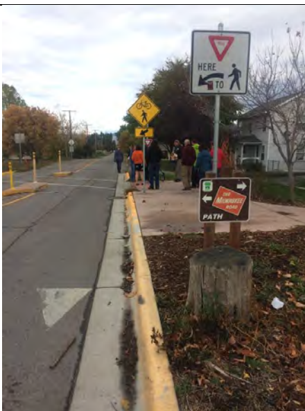
Junction of Milwaukee Trail & Davis St.

Concern exists that excessive signage in this location distracts motorists from seeing pedestrians