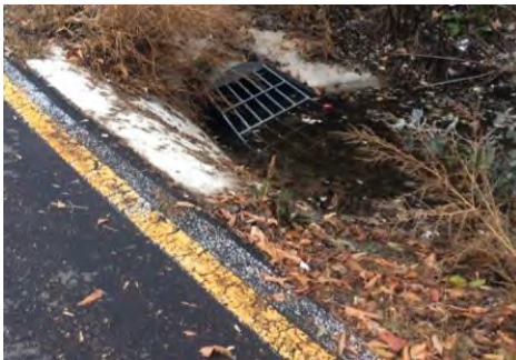
N. Johnson St.