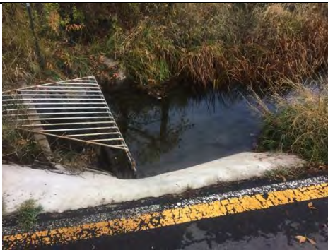
N. Johnson St. & N. Grant St.

Blind corner on Milwaukee Trail: Safety concern for trail users when bicyclists are travelling at speed