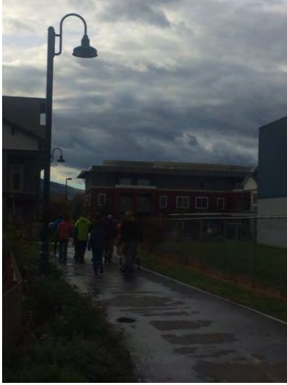
Milwaukee Trail adjacent Corso apartments