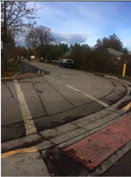
Junction of S. Garfield St. & Trail St.

A section of road with adequate sidewalks; this is unfrequent in the neighborhood