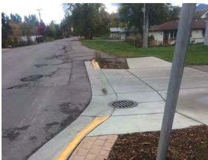
N. Curtis St. 1