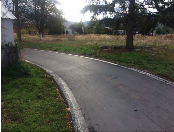
Milwaukee Trail between Catlin St. & S. Garfield St.

Blind corner on Milwaukee Trail: Safety concern for trail users when bicyclists are travelling at speed