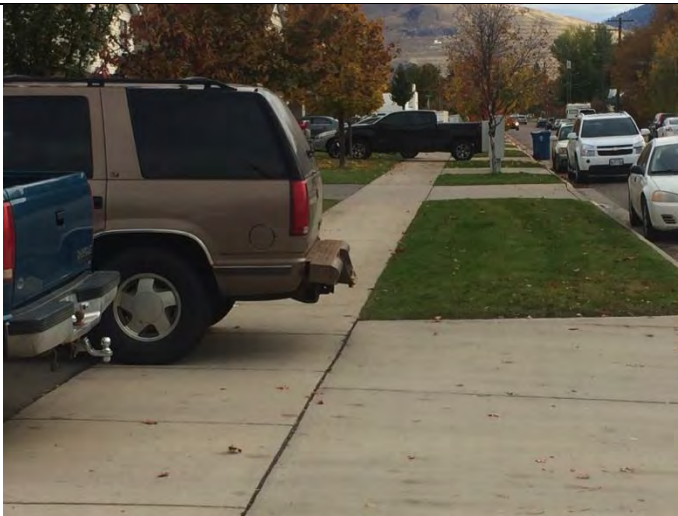
Wyoming St., between N. Johnson St. and N. Garfield St.