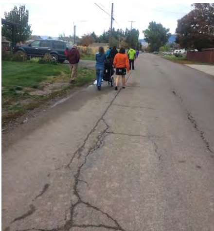
N. Davis St.