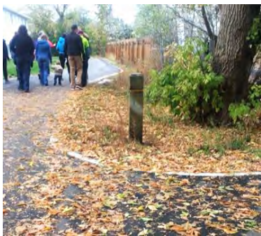
Milwaukee Trail & N. Johnson St. 4