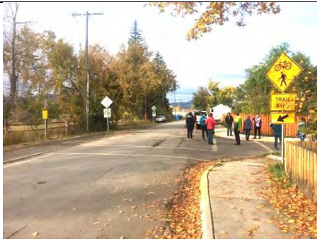
Justus Ln. & Trail St. 1