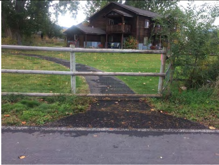
Milwaukee Trail between Trail St. & N. Johnson St.