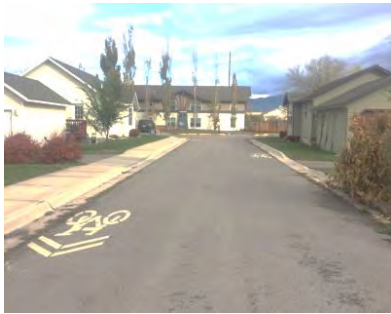
Justus Lane 2