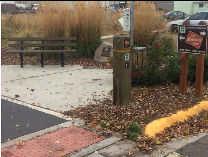
Milwaukee Trail & private drive south of N. Grant St.