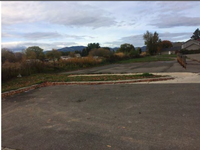
Public area adjoining Lafray Park