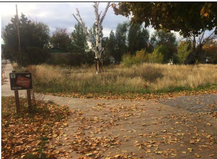
Junction of Milwaukee Trail & Catlin St.