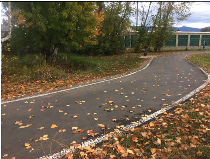
Milwaukee Trail between Curtis St. & Davis St.