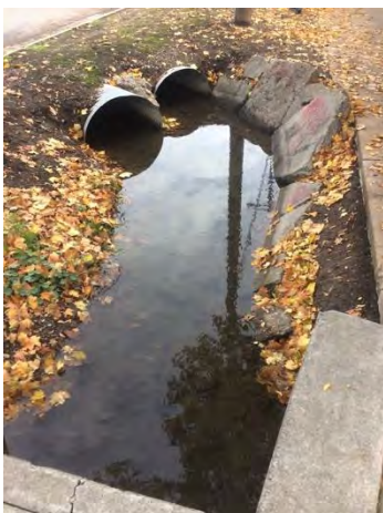
Wyoming St. & Garfield St.