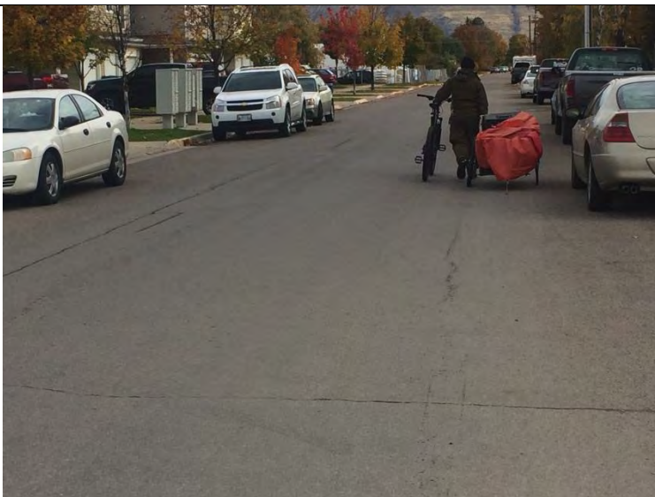
Wyoming St., between N. Johnson St. and N. Garfield St.

Street too narrow for two lanes of vehicular traffic to pass safely