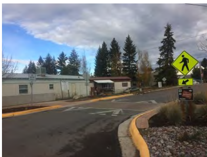
Milwaukee Trail & Catlin St. crosswalk 5