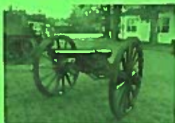
1863 Civil War Ordnance Gun at RMMMH

The Rocky Mountain Museum of Military History promotes the commemoration and study of the U.S. armed services, from the Frontier Period to