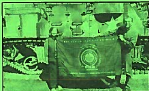
U.S. Army M7 "Priest" self-propelled howitzer and Vietnam 50th flag at RMMMH

the War on Terrorism. The Museum strives to impart a greater understanding of the roles played by America's service-men and service-women through this period of dramatic global change. The U.S. Fourth Infantry Regiment and the Civilian Conservation Corps constructed the Museum buildings (ca. 1936) during the Great Depression. Headquartered in Buildings T-310 and T-316 by special arrangement with the Montana National Guard, the Museum exhibits from a wide collection of documents and artifacts. These include an 1863 Union militia ordnance cannon, a detailed model of and items from the ship (USS Missoula) and Marine (PFC Louis Charlo) responsible for the raising of the first US flag over Iwo Jima during World War II, and a UH-1H "Huey" Helicopter gunship used during the Vietnam War.