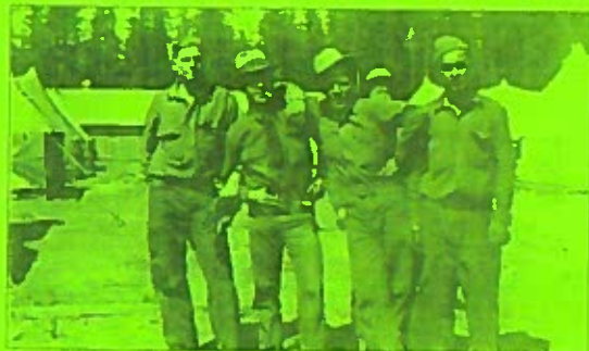
Fort Missoula District CCC Corpomen, Swan Lake, MT 1935

Headquartered at Bldgs. T-310 and T-316 at Ft. Missoula, Montana, adjacent to the Historical Museum at Ft. Missoula. From I-90, take U.S. Hwy 93 Exit south to the junction of Reserve St. and South Ave. Proceed west on South Ave., turn left at Fort Missoula Entrance, right on Col. Burt St., left on Gen. Foster Ave.