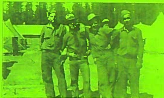
Fort Missoula District CCC Corpsmen, Swan Lake, MT 1935

Headquartered at Bldgs. T-310 and T-316 at Ft. Missoula, Montana, adjacent to the Historical Museum at Ft. Missoula. From I-90, take U.S. Hwy 93 Exit south to the junction of Reserve St. and South Ave. Proceed west on South Ave., turn left at Fort Missoula Entrance, right on Col. Burt St., left on Gen. Foster Ave.