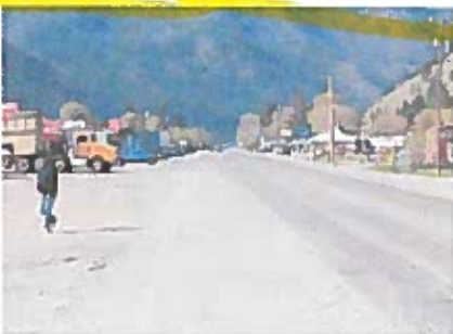
bicycle and pedestrian safety is a key issue for Highway 200