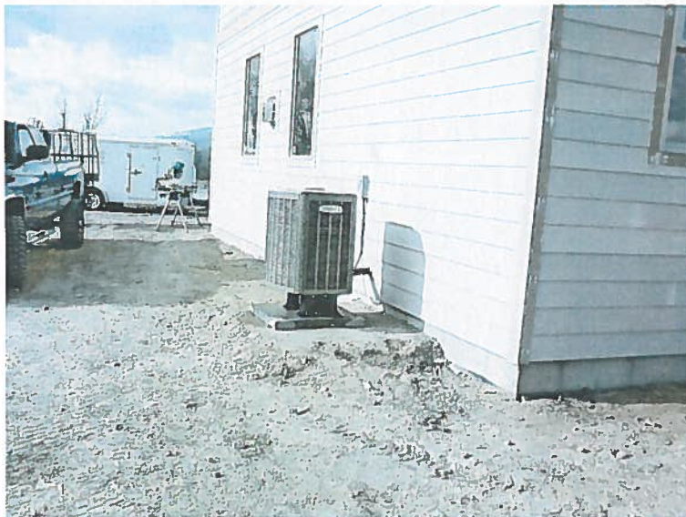
4/11/2011 Right View