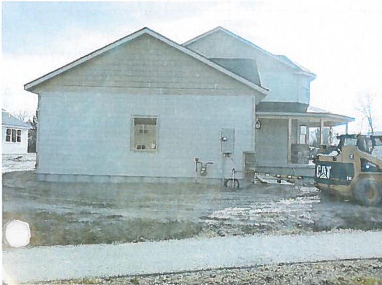
4/11/2011 Left View