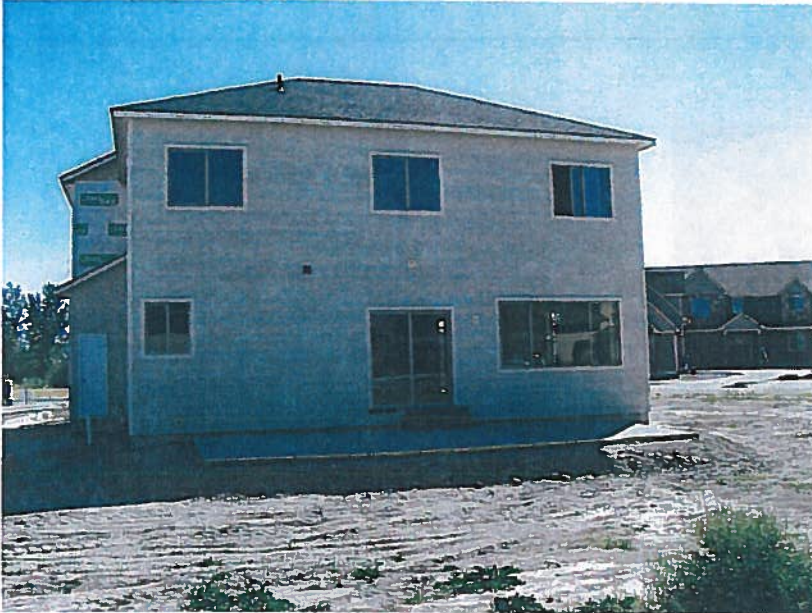
Rear (North) View