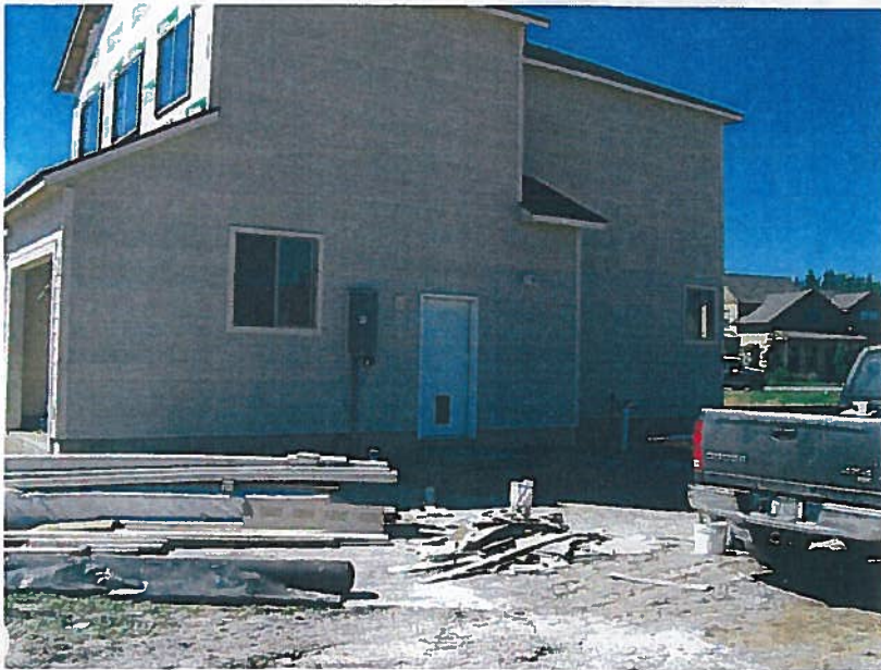
Right (East) View