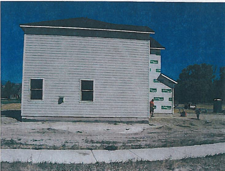
Left (West) View