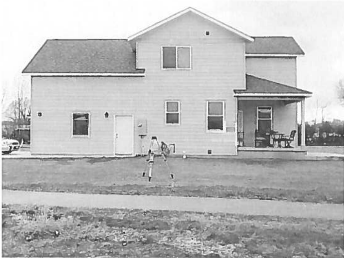
04/26/11 Right View