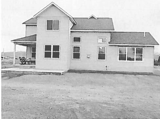
04/26/11 Rear View