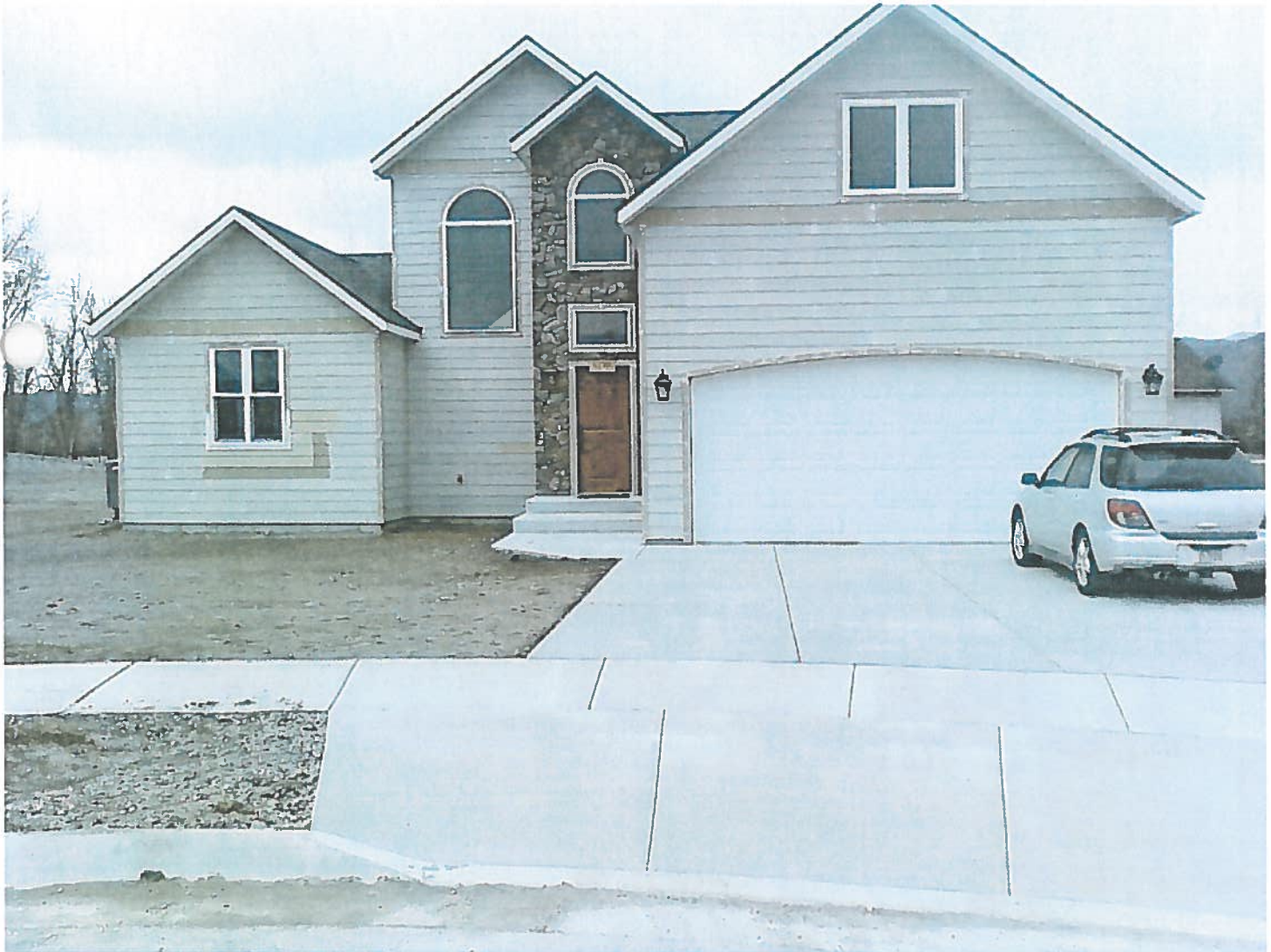
04/26/11 Front View