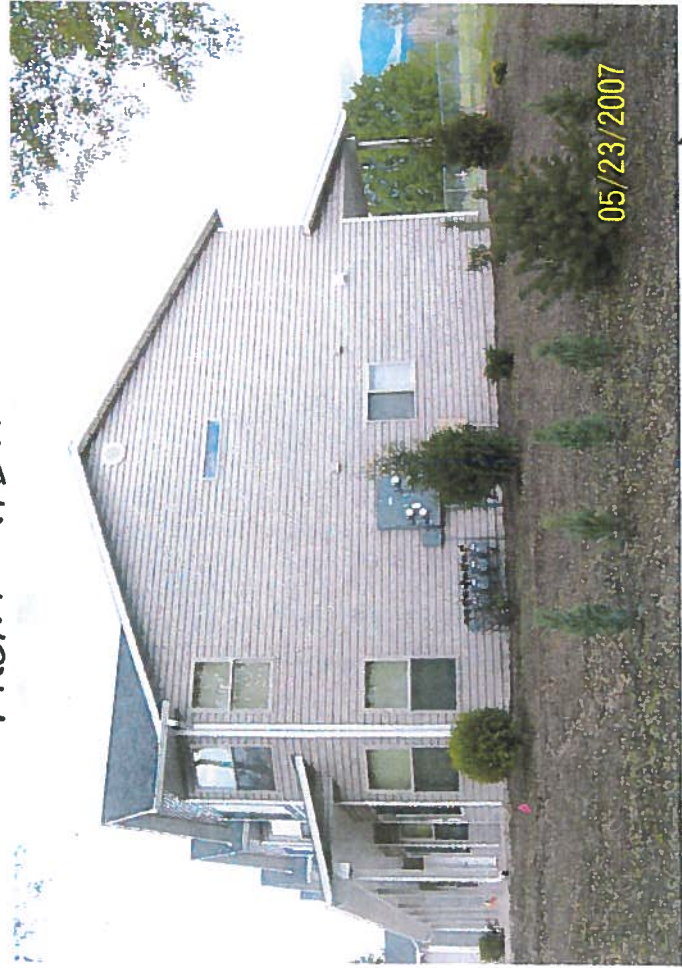
RIGHT SIDE VIEW (OPTIONAL)