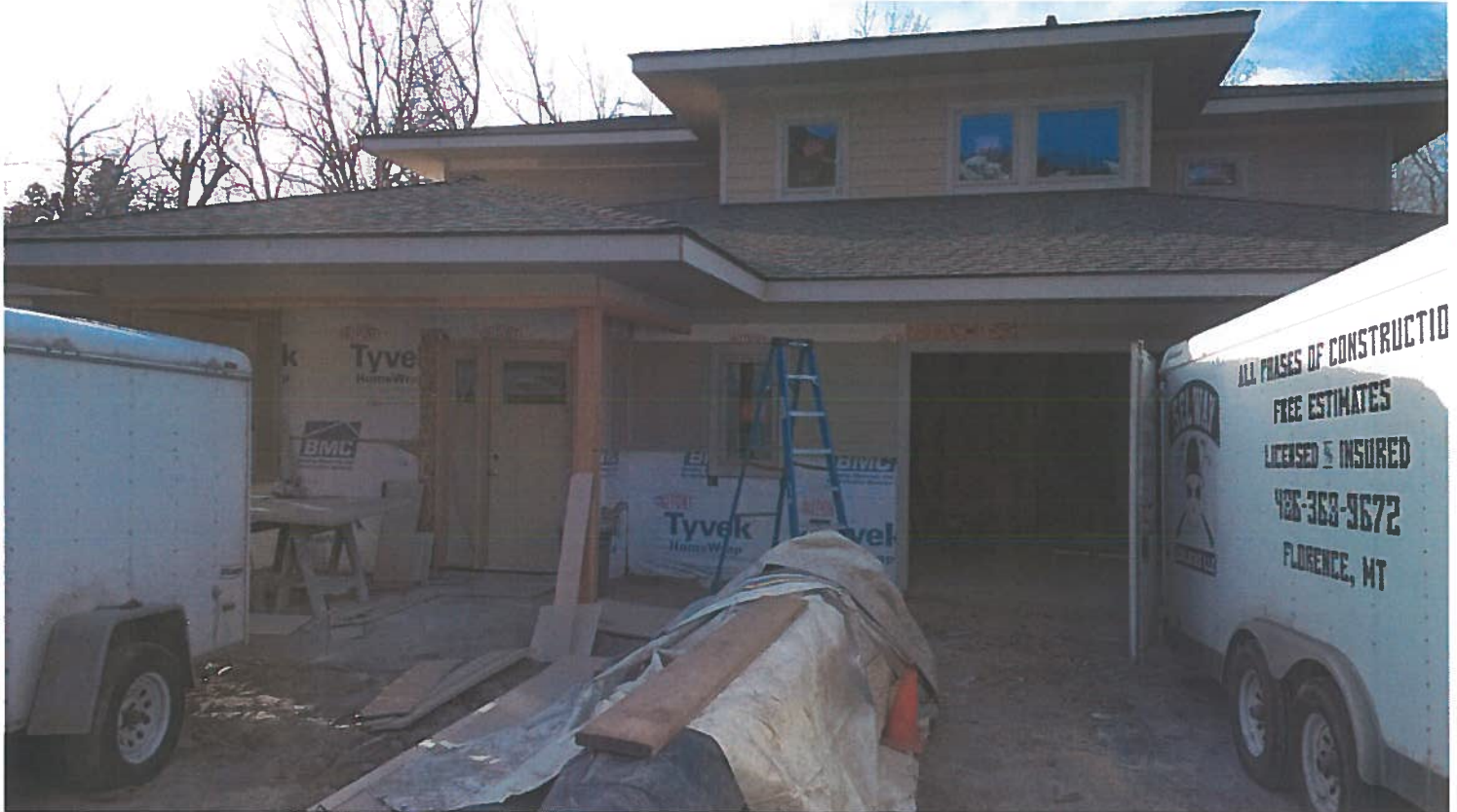
12/15/2014 Front View

If using the Elevation Certificate to obtain NFIP flood insurance, affix at least 2 building photographs below according to the instructions for Item A6. Identify all photographs with date taken; "Front View" and "Rear View"; and, if required, "Right Side View" and "Left Side View." When applicable, photographs must show the foundation with representative examples of the flood openings or vents, as indicated in Section A8. If submitting more photographs than will fit on this page, use the Continuation Page.