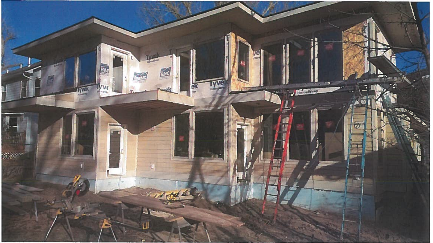
12/15/2014 Rear View

If submitting more photographs than will fit on the preceding page, affix the additional photographs below. Identify all photographs with: date taken; "Front View" and "Rear View"; and, if required, "Right Side View" and "Left Side View." When applicable, photographs must show the foundation with representative examples of the flood openings or vents, as indicated in Section A8.