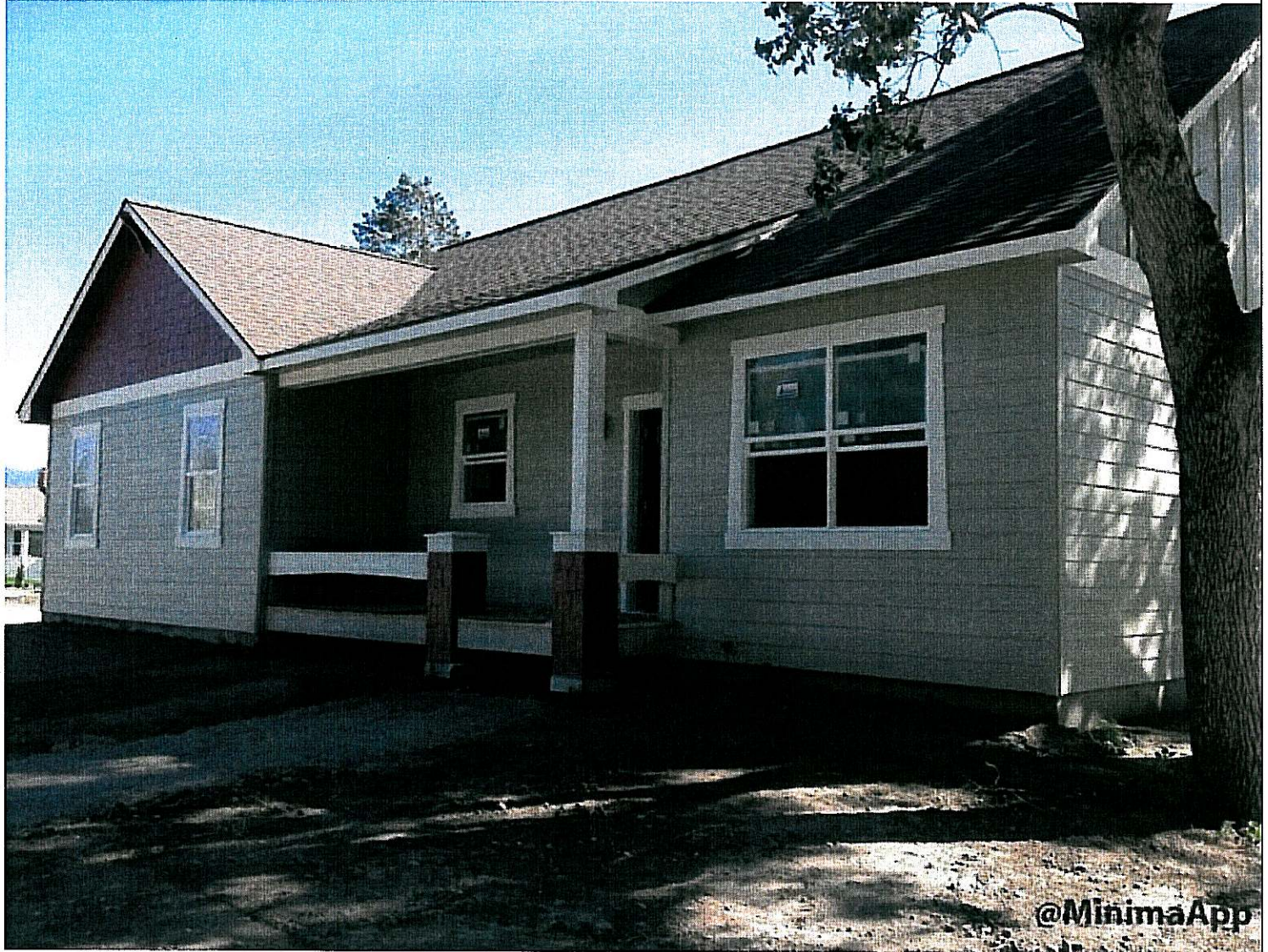
West side of house, taken 8/25/14.

If using the Elevation Certificate to obtain NFIP flood insurance, affix at least 2 building photographs below according to the instructions for Item A6. Identify all photographs with date taken; "Front View" and "Rear View"; and, if required, "Right Side View" and "Left Side View." When applicable, photographs must show the foundation with representative examples of the flood openings or vents, as indicated in Section A8. If submitting more photographs than will fit on this page, use the Continuation Page.