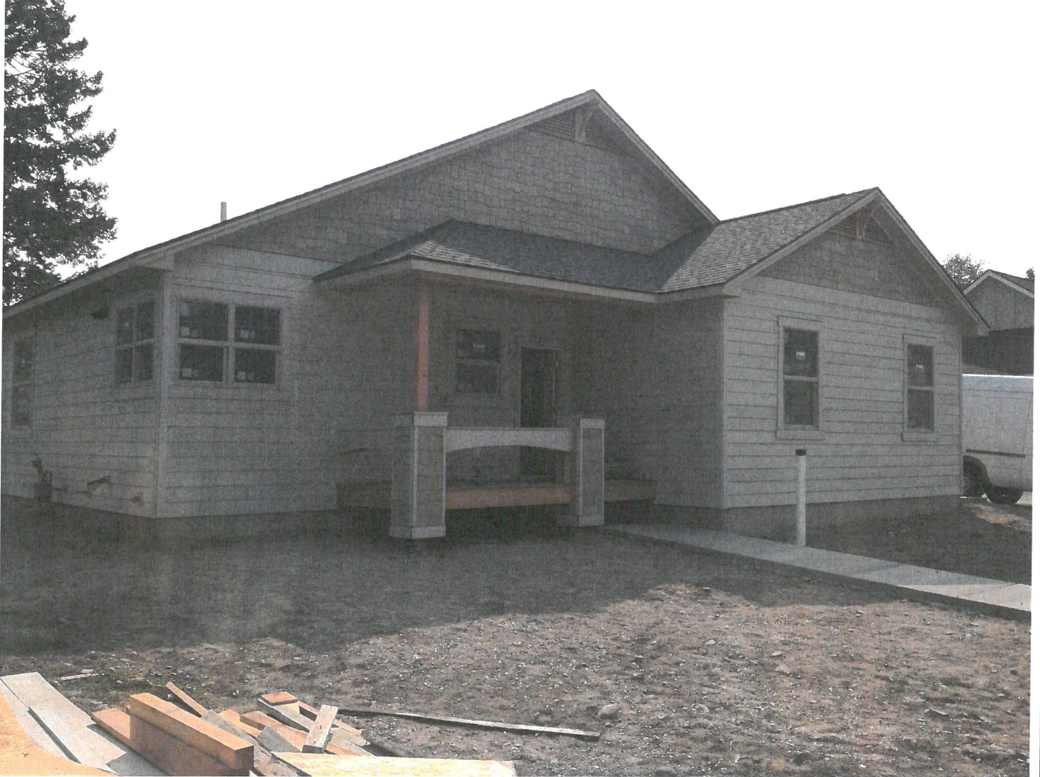
West Side 8-18-15

If submitting more photographs than will fit on the preceding page, affix the additional photographs below. Identify all photographs with: date taken; "Front View" and "Rear View"; and, if required, "Right Side View" and "Left Side View." When applicable, photographs must show the foundation with representative examples of the flood openings or vents, as indicated in Section A8.