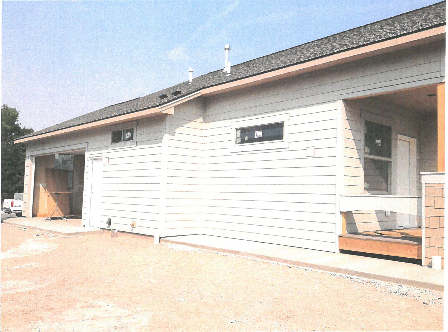
South Side 8-18-15

If using the Elevation Certificate to obtain NFIP flood insurance, affix at least 2 building photographs below according to the instructions for Item A6. Identify all photographs with date taken; "Front View" and "Rear View"; and, if required, "Right Side View" and "Left Side View." When applicable, photographs must show the foundation with representative examples of the flood openings or vents, as indicated in Section A8. If submitting more photographs than will fit on this page, use the Continuation Page.