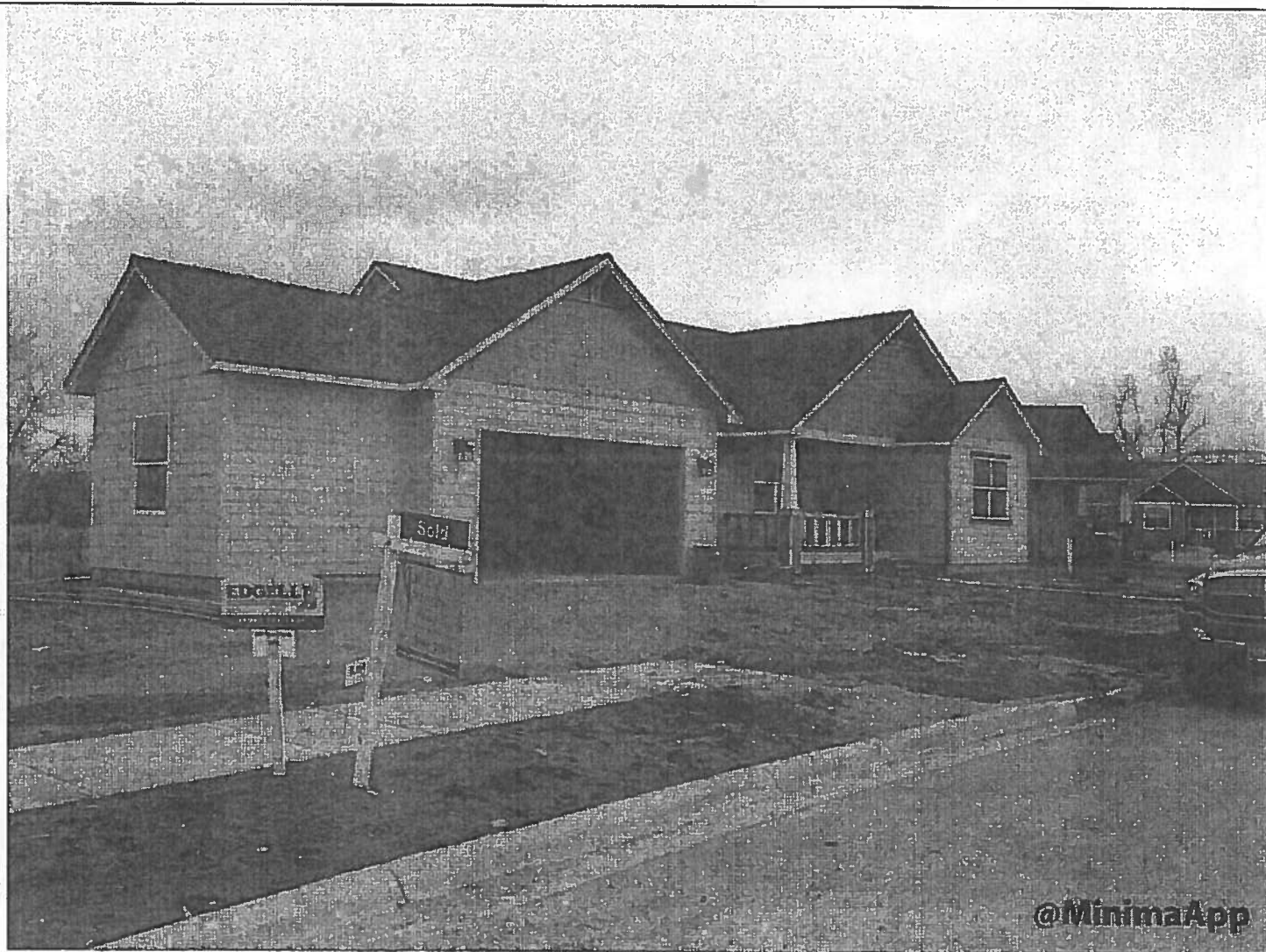
East Elevation, 3-18-2014

If using the Elevation Certificate to obtain NFIP flood insurance, affix at least 2 building photographs below according to the instructions for Item A6. Identify all photographs with date taken; "Front View" and "Rear View"; and, if required, "Right Side View" and "Left Side View." When applicable, photographs must show the foundation with representative examples of the flood openings or vents, as indicated in Section A8. If submitting more photographs than will fit on this page, use the Continuation Page.