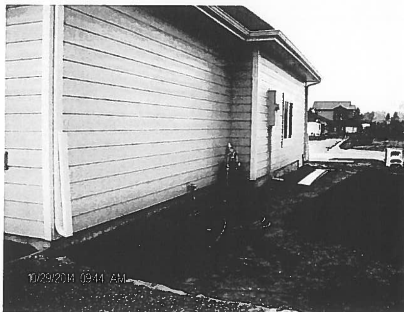
Side - North