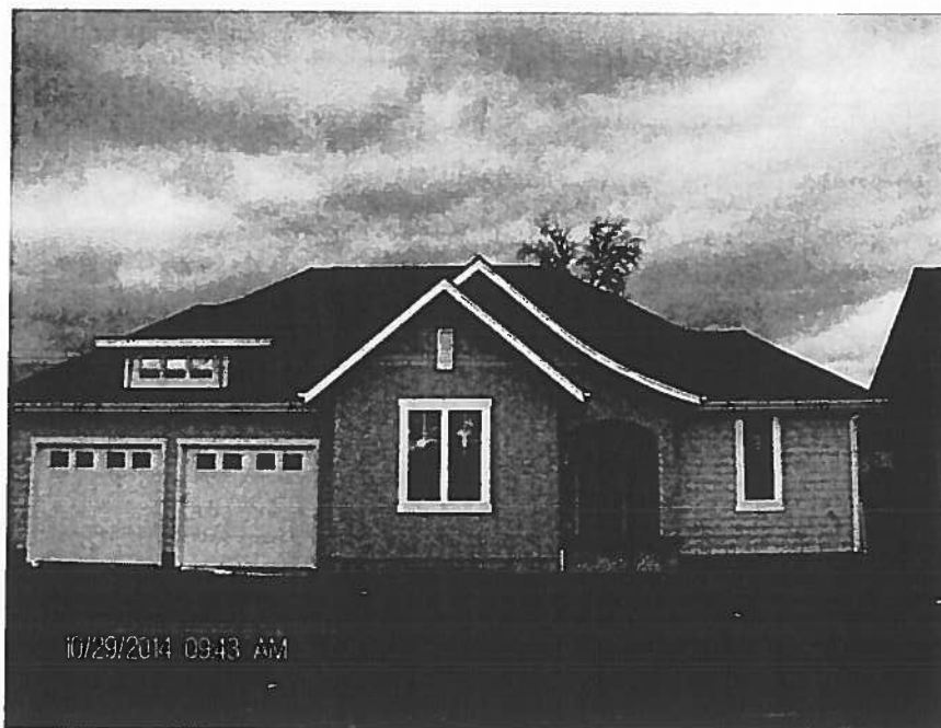
Front - West

If using the Elevation Certificate to obtain NFIP flood insurance, affix at least 2 building photographs below according to the instructions for Item A6. Identify all photographs with date taken; "Front View" and "Rear View"; and, if required, "Right Side View" and "Left Side View." When applicable, photographs must show the foundation with representative examples of the flood openings or vents, as indicated in Section A8. If submitting more photographs than will fit on this page, use the Continuation Page.