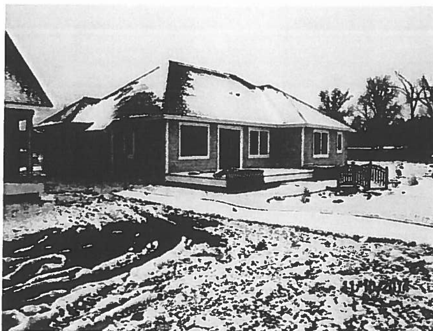
Rear - East