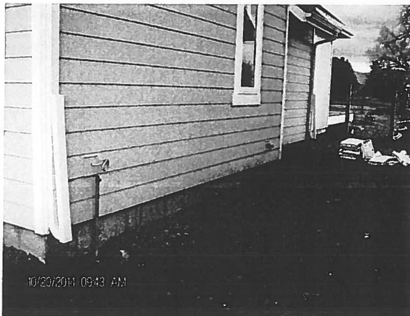
Side - South

If submitting more photographs than will fit on the preceding page, affix the additional photographs below. Identify all photographs with: date taken; "Front View" and "Rear View"; and, if required, "Right Side View" and "Left Side View." When applicable, photographs must show the foundation with representative examples of the flood openings or vents, as indicated in Section A8.